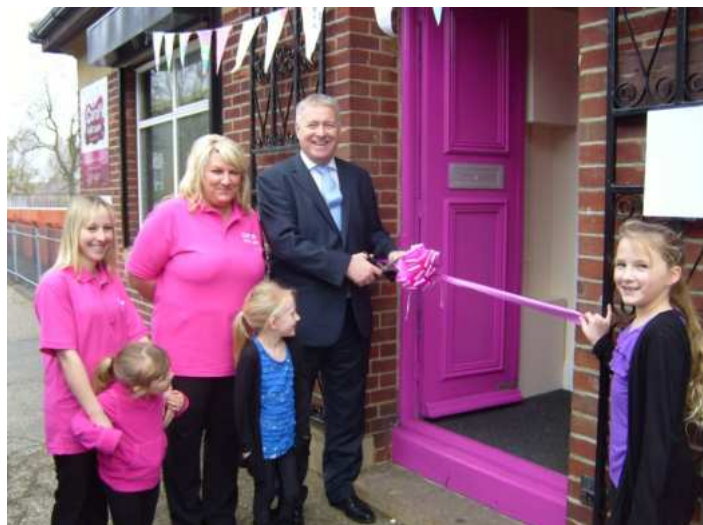
MP Ian Lavery officially opens Carols Kidz Care

(former Rascals building) School Road Bedlington Station