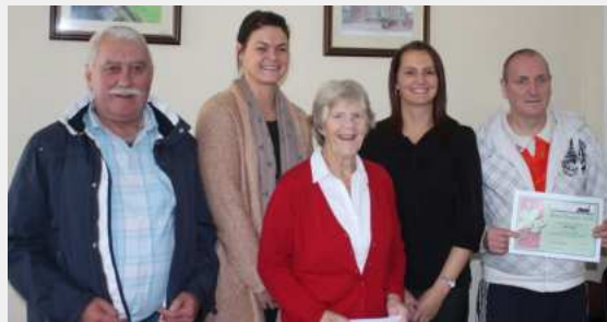
Pictured 2012 Bernicia winners

To qualify you must be an existing Bernicia Tenant in the East Bedlington Parish—simply complete the entry form and return to the Parish Office.