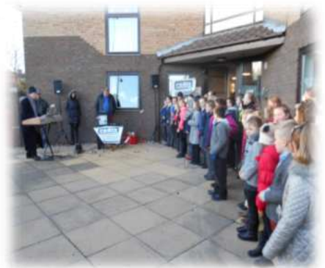
Joint choirs from Stead Lane & Bedlington Station Primary Schools