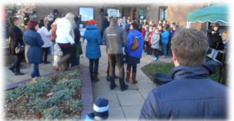
Thank you to everyone who turned out to our switch on event I am sure you will agree our young people are very talented!