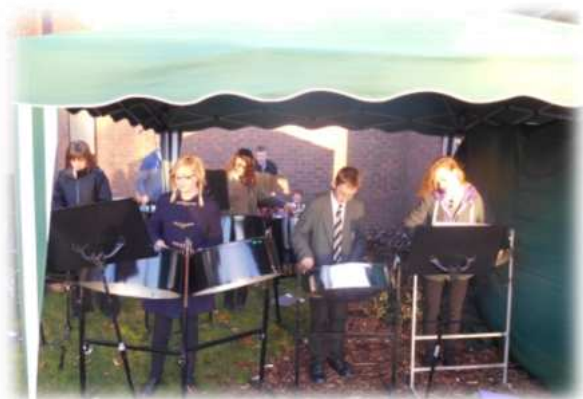
Bedlington High School Steel Pan Band played a selection of seasonal tunes