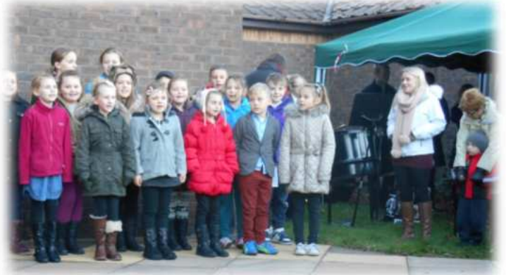
Children from Bedlington Station Primary School prepared their own song