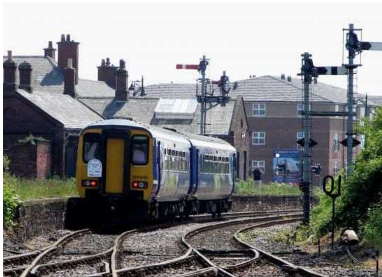
Charter Train leaving Bedlington Station

Following the approval of Northumberland County Council's full budget back in February, SENRUG understands the Council now has the funding in place to proceed with the next stage of re-opening the rail line from Newcastle to Ashington and Woodhorn, which is the formal GRIP3 Study with Network Rail. Additionally, SENRUG is delighted that the new franchise specification for Northern Rail released by the Department for Transport (DfT) on 27 th February requires whoever will be running the franchise from 2017 to work with Northumberland County Council to move the re-opening forward. SENRUG has been campaigning for this new rail passenger service which will link Bedlington Station to Newcastle in the south, and to Ashington and hopefully Woodhorn in the north, for 10 years. Many people will remember