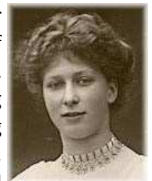
HRH Princess Mary