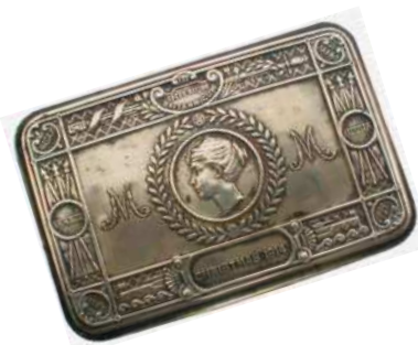
Cigarette box 1914